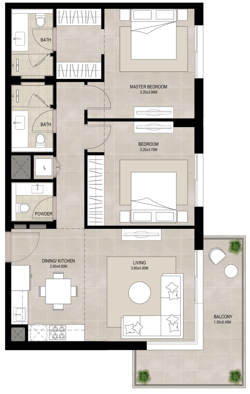
*Balcony sizes vary