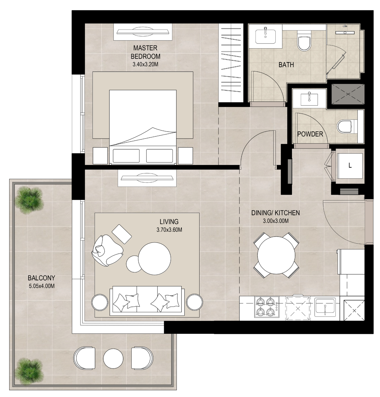
*Balcony sizes vary