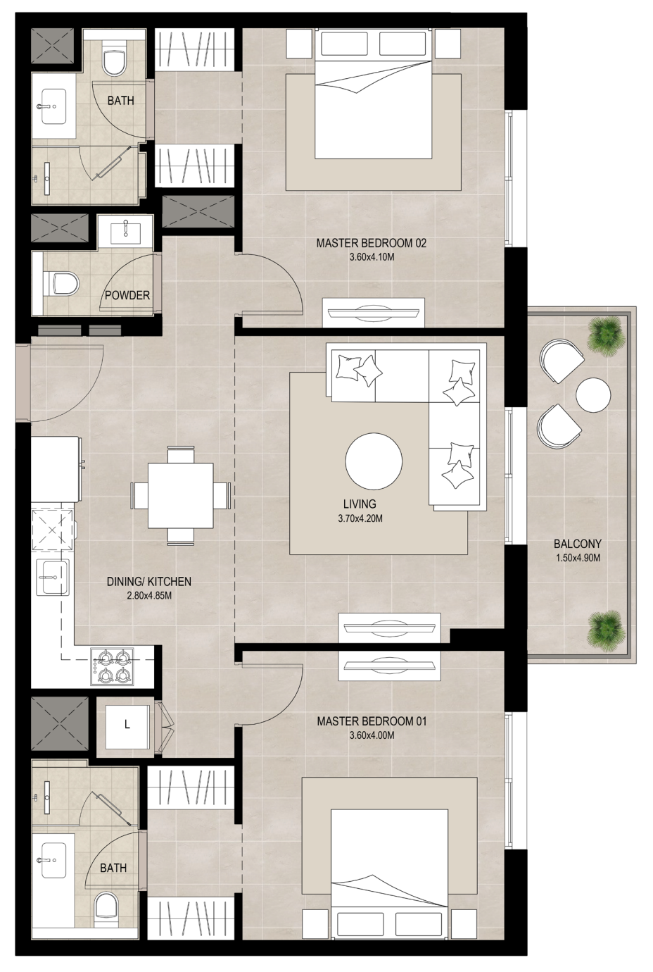
*Balcony sizes vary