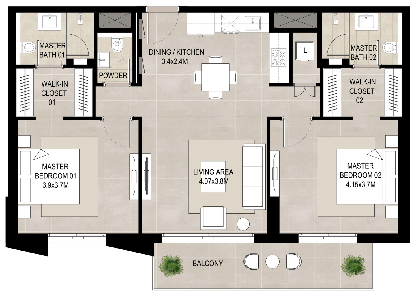
*Balcony sizes vary