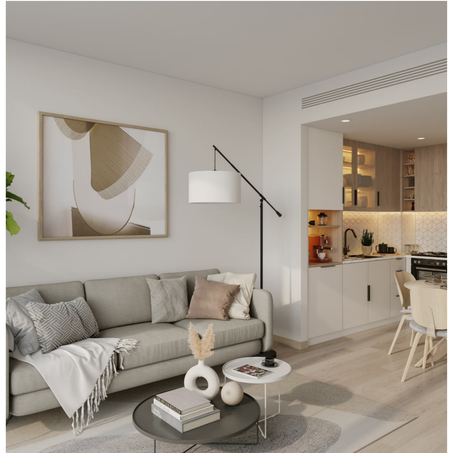
1 BEDROOM - LIVING ROOM