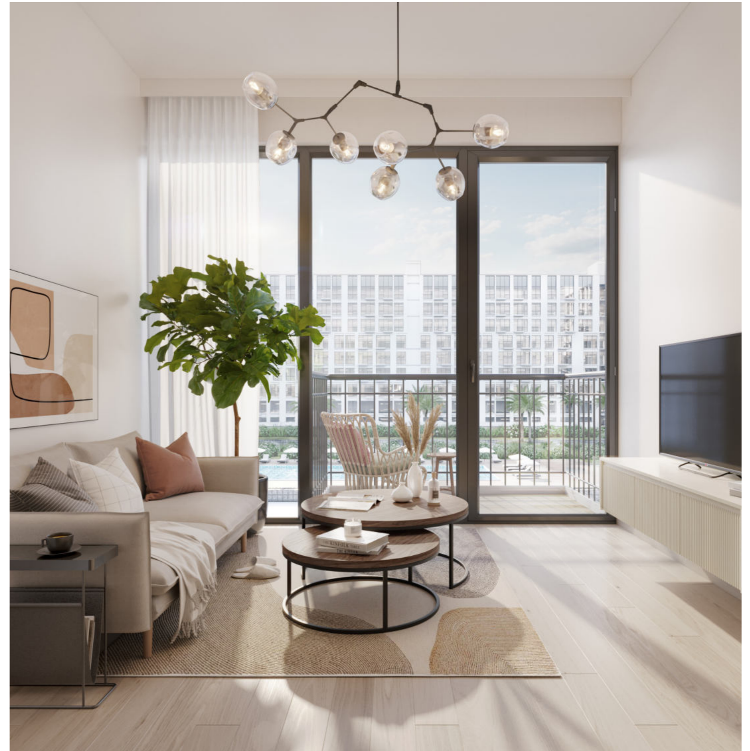
STUDIO LIVING ROOM