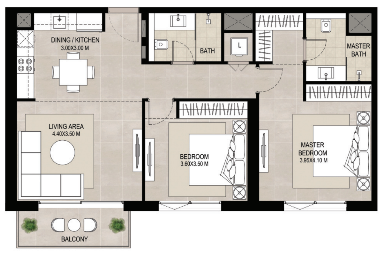
*Balcony sizes vary