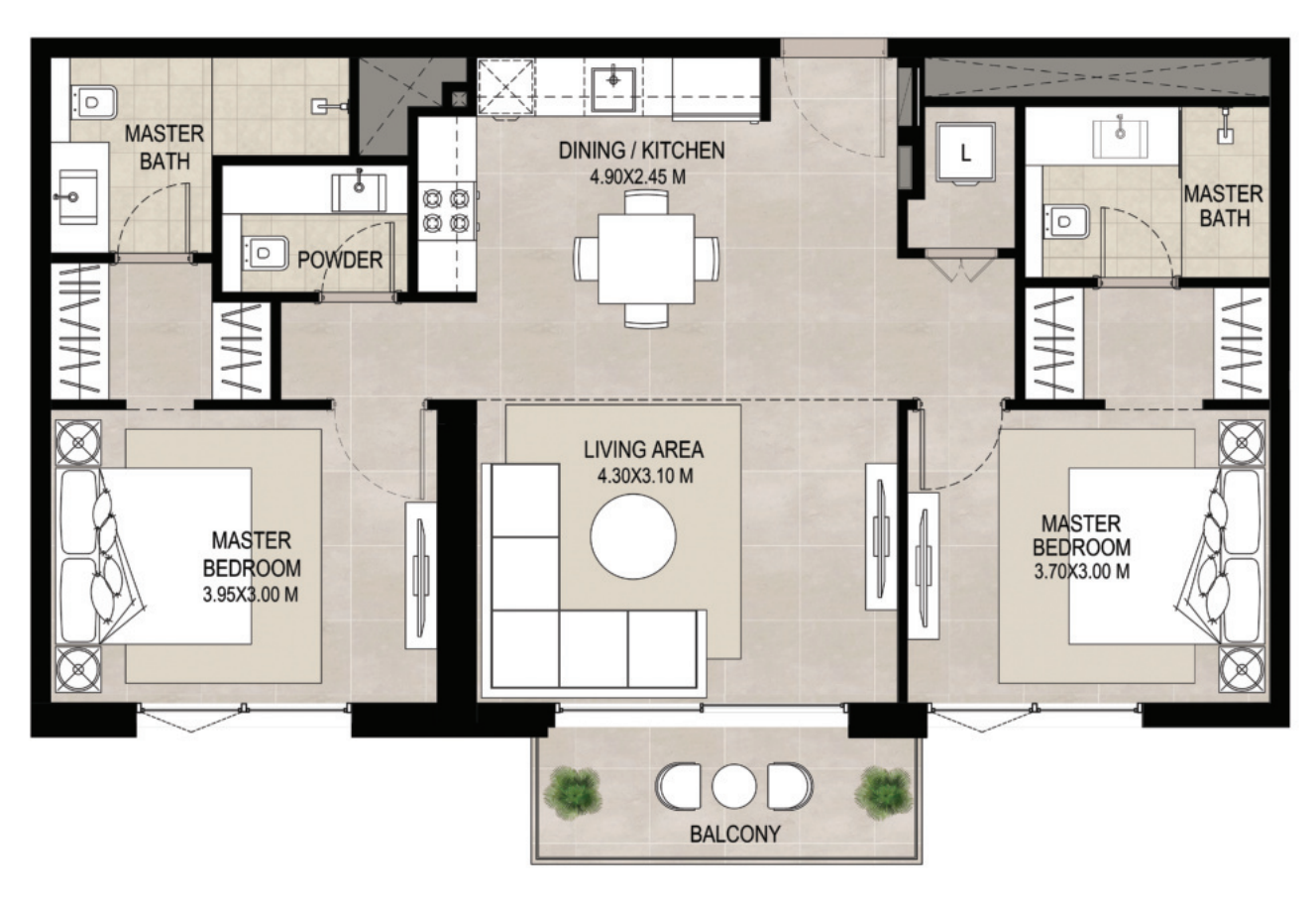
*Balcony sizes vary