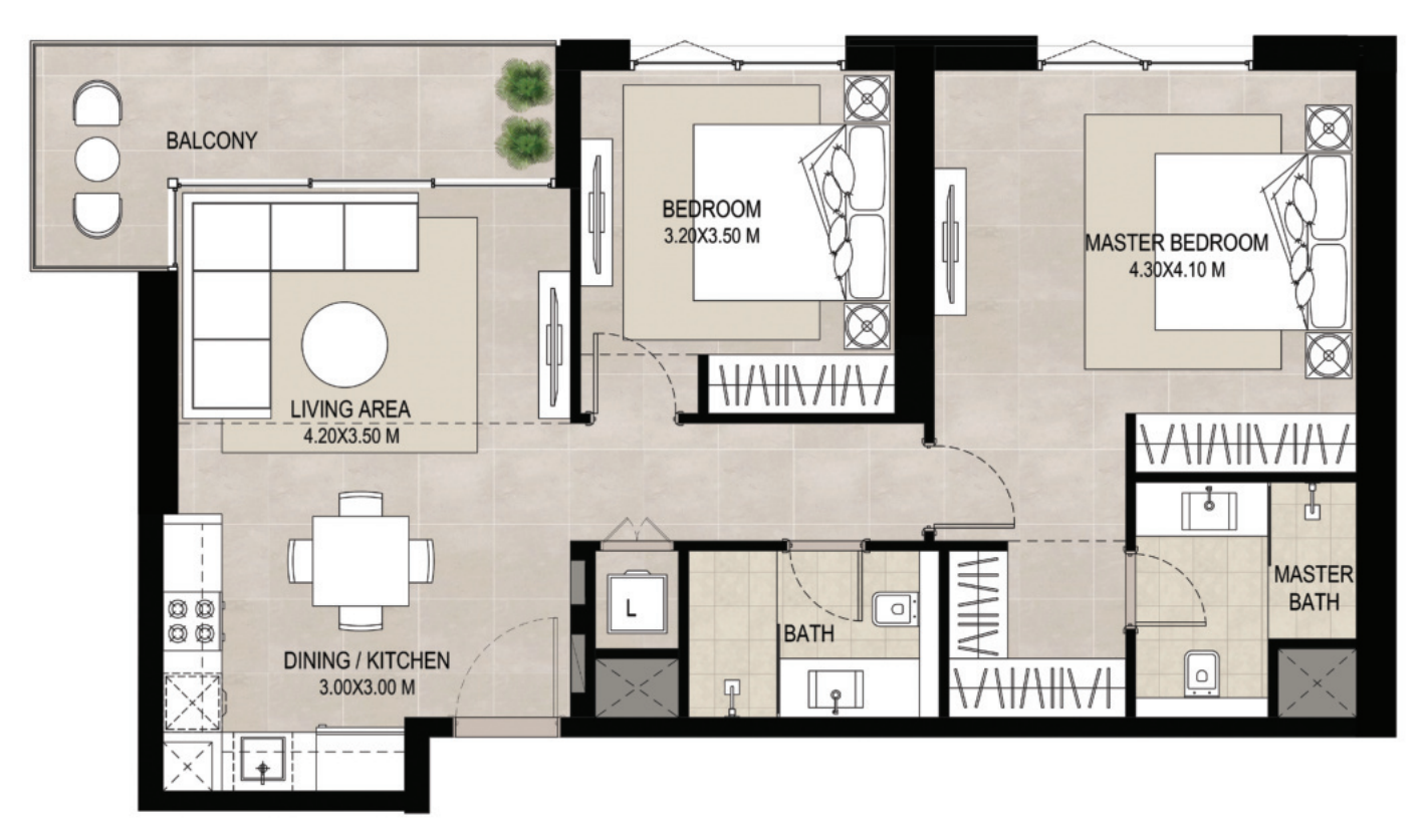
*Balcony sizes vary