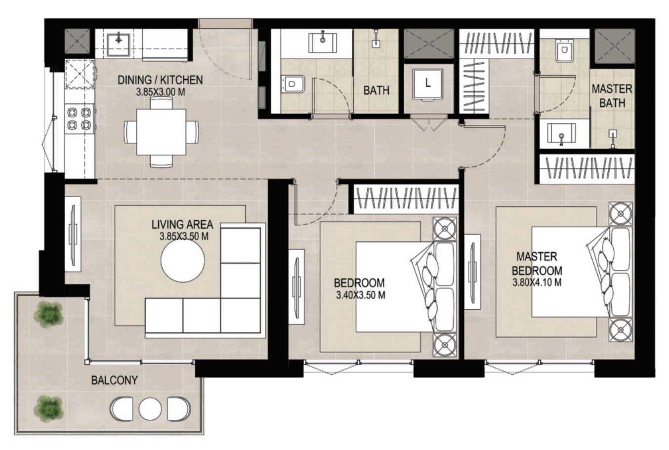
*Balcony sizes vary