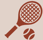
Padel Tennis Court