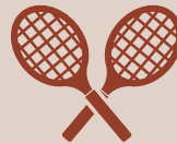
Squash & Tennis Court