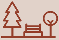
Town Square Park