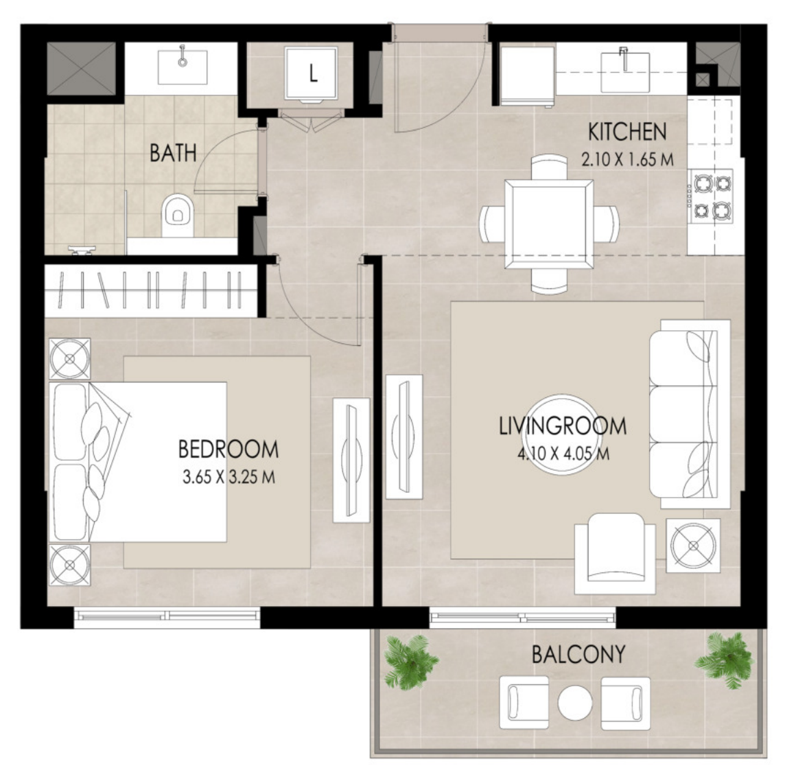
*Balcony sizes vary