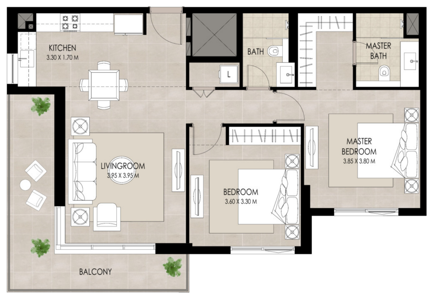
*Balcony sizes vary