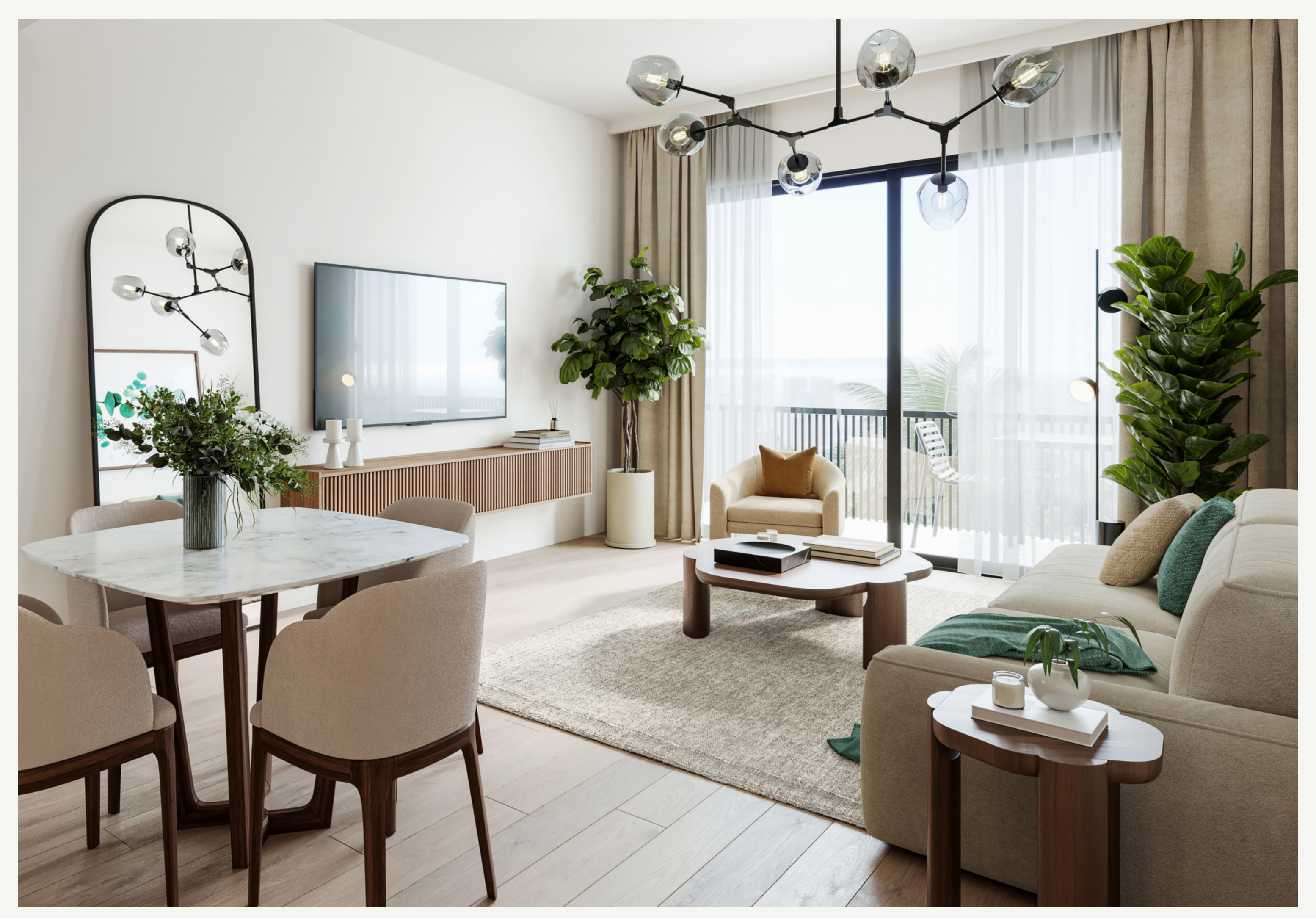
NSHAMA | HOLLAND GARDENS 11