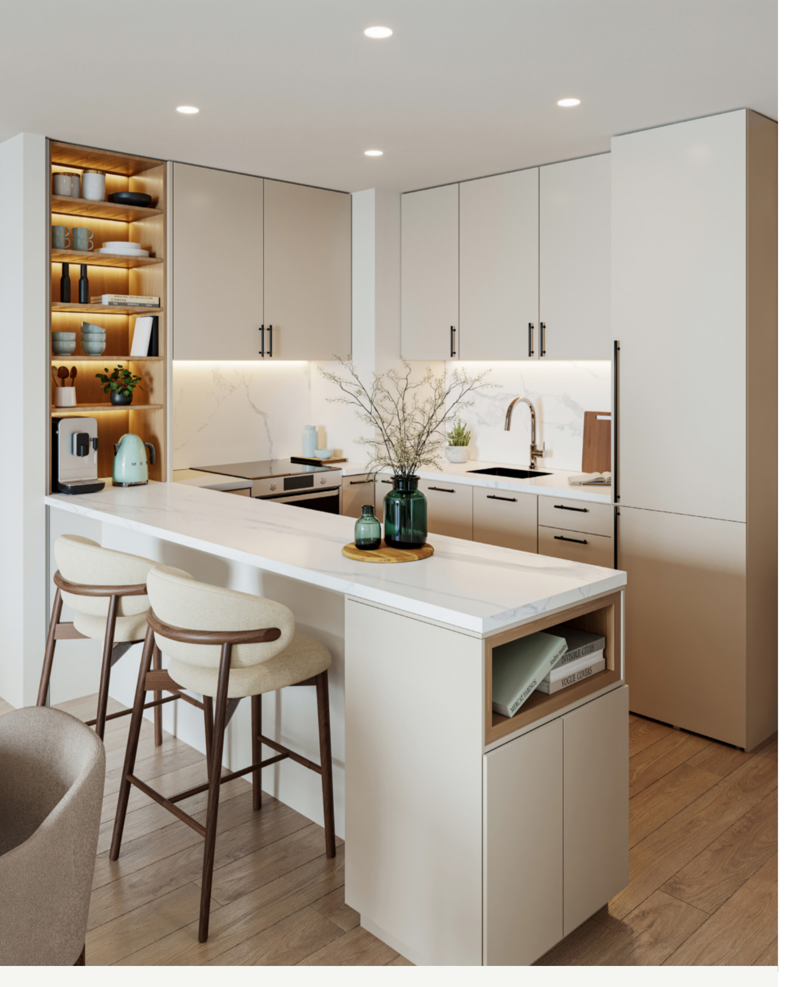
Aesthetic and functional - each space is carefully designed to offer you a home you can truly call your own!