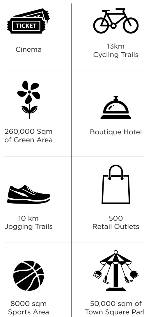
50,000 sqm of Town Square Park