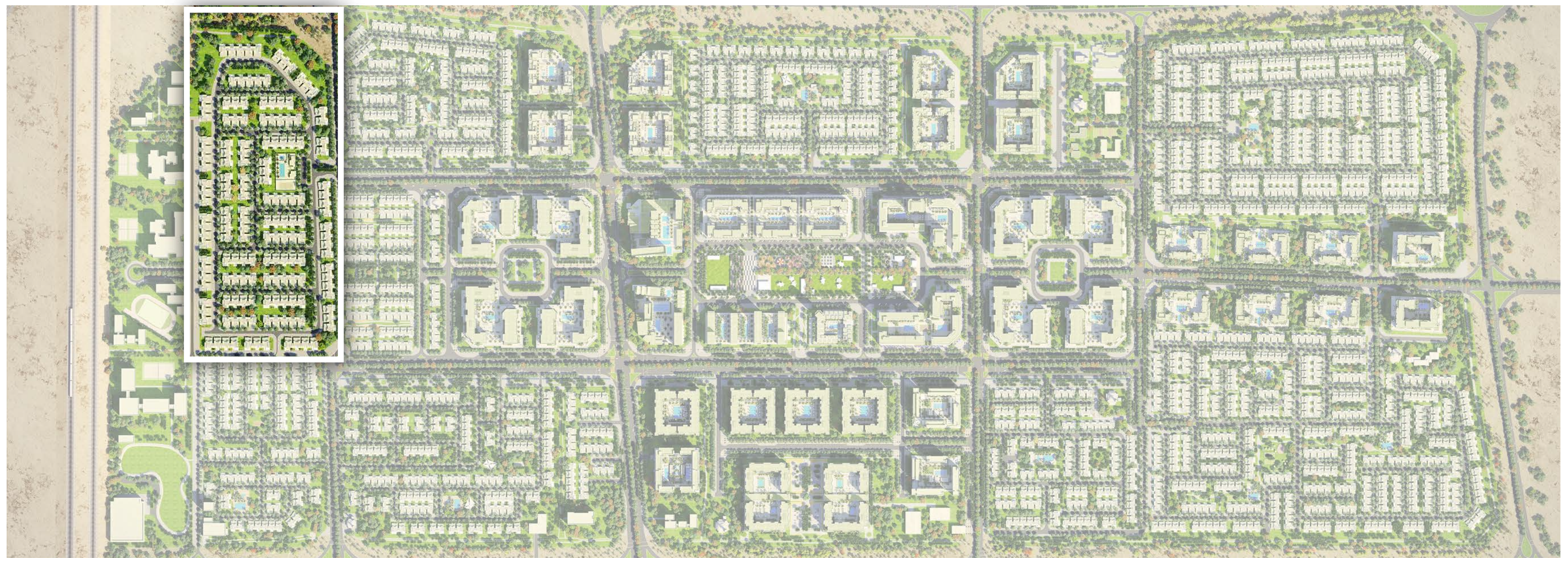
Town Square Facts